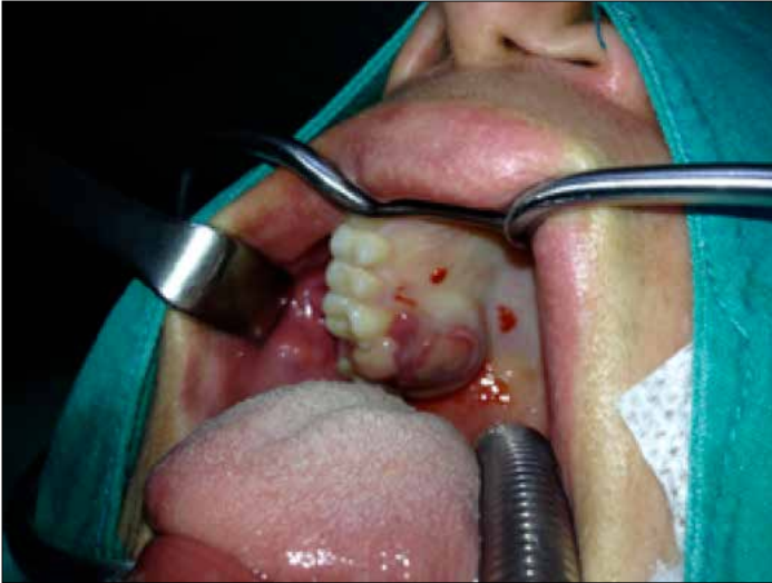
Figure 1. Preoperative view of the lesion in the maxillary molar region