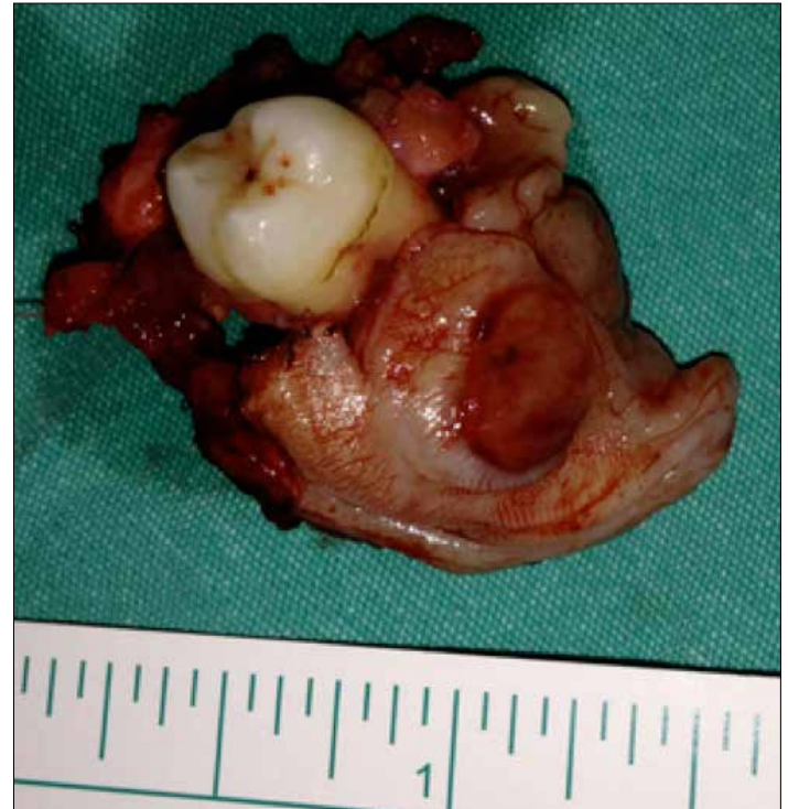
Figure 3. Macroscopic view of the excised tumor